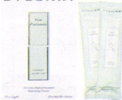
Bvlgari Oshibori au the vert towelettes.

Tucked into a sturdy compact, it comes in a TSA-approved pressed-powder format.