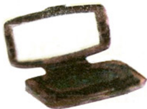
La Femme cake mascara.

New carry-on regulations have left female fliers in a cosmetics conundrum. With common products banned, USA Today's Colleen Clark went in search of liquid-free alternatives, from foundation to face wash. A sampling: