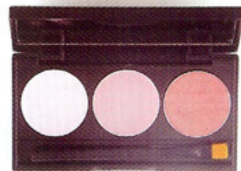
It's OK to be a little starry-eyed when you wear Philosophy Supernatural Finger Paints in Cool. $25 at Sephora.