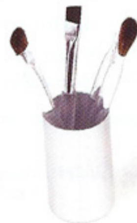
Japonesque Touch-Up Tube Set has a brush to cover up bases—and faces for that matter. $15 at Ulta.