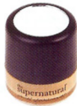
Don't get spooked by how smooth skin appears when you use Philosophy Supernatural Airbrushed Canvas in Beige. $35 at Sephora.