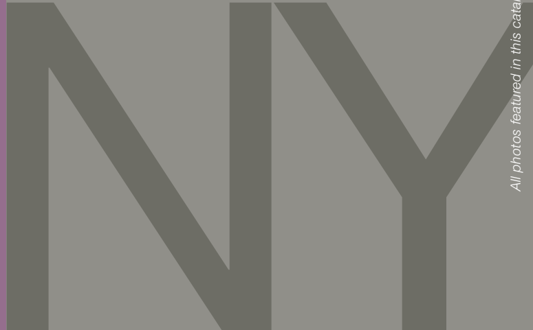
All photos featured in this catalog represent student work or class environments from the New York Campus